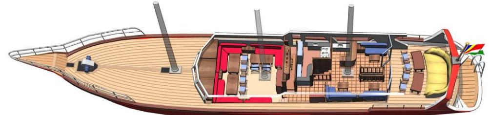
Sailing Yacht Sea Star - deck plan

Sun Deck, Back Deck, Dining Salon, Lounge/Salon