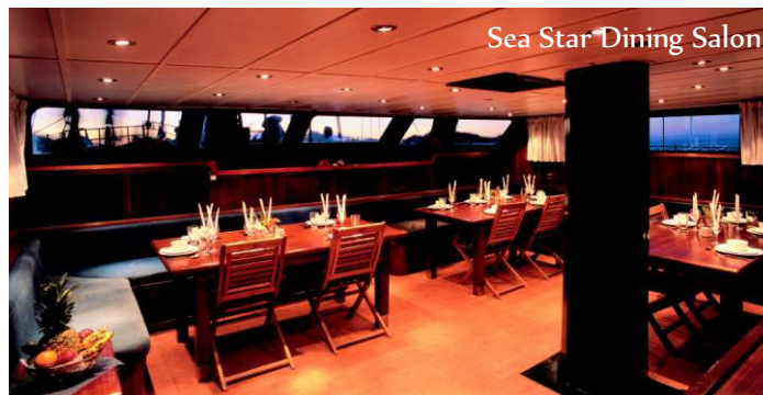
Sea Star Dining Salon