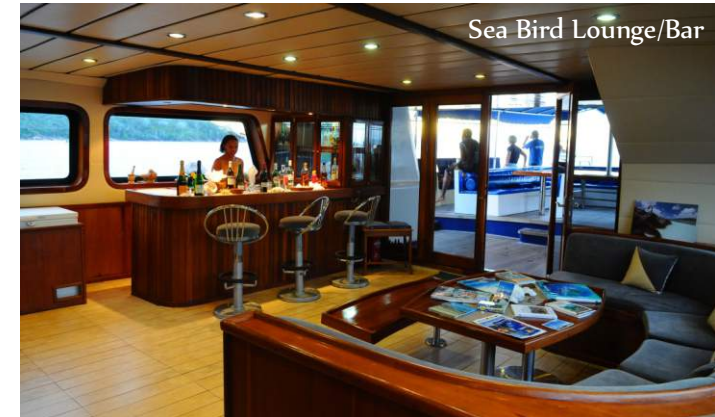
Sea Bird Lounge/Bar