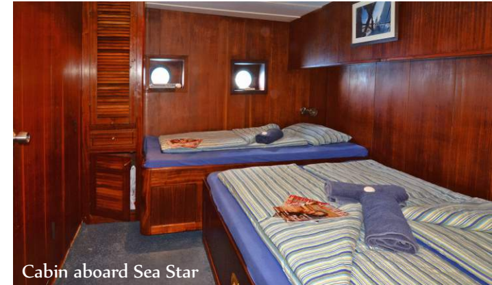
Cabin aboard Sea Star