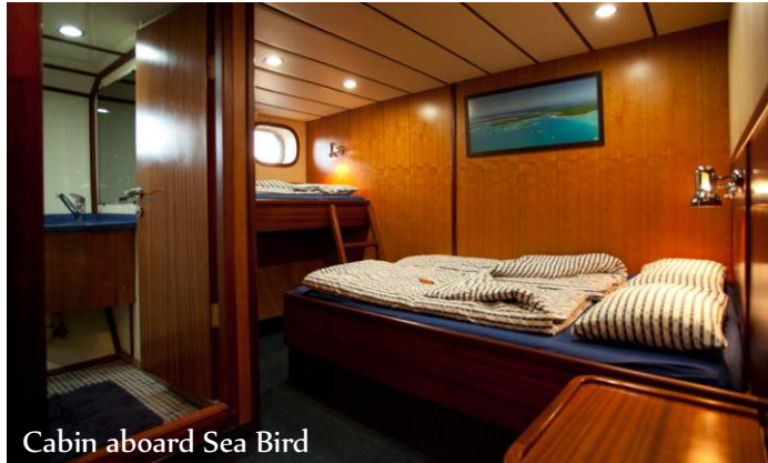
Cabin aboard Sea Bird

Sea Star & Sea Bird are each hosted by a crew of 9, to ensure our crew-to-guest ratio is always at least 1-to-2, even at maximum occupancy. The crew includes a captain, engineer, 2 deckhands, 3 stewardesses, a dive instructor and a dedicated chef.