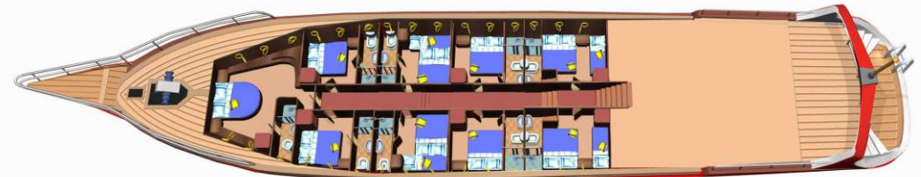
Sailing Yacht Sea Star - accommodation plan