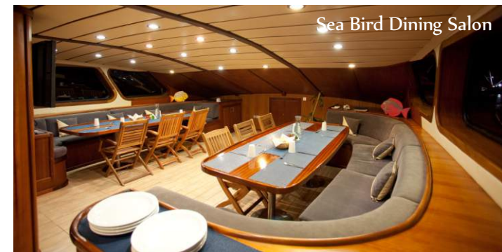
Sea Bird Dining Salon