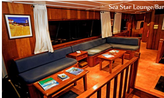
Sea Star Lounge/Bar

Our stewardesses are always at the ready to serve drinks from our bar, be it for an afternoon refreshment, an aperitif at sunset or a glass of wine with dinner. However, in order to create an atmosphere in which our guests can feel at home onboard, we also allow self-service at our bar - guests are welcome to help themselves to drinks from the refrigerator at the bar by simply marking down their selections to be added to their bill.