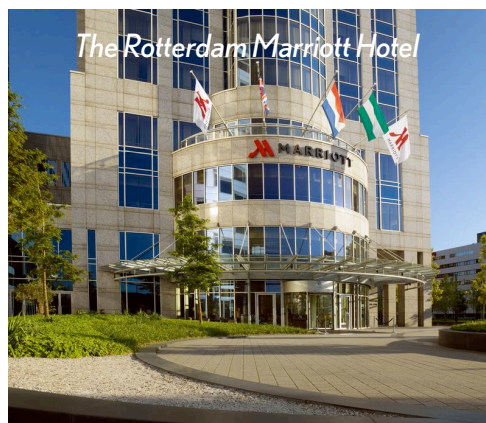
The Rotterdam Marriott Hotel