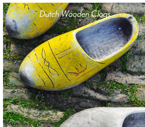
Dutch Wooden Clogs

Kinderdijk is a small village a little over nine miles east of Rotterdam with the largest concentration of old windmills in the world! The 18th century windmills of Kinderdijk are one of the major tourist sites in the country and are on the UNESCO list of World Heritage Sites. You will be mesmerized by the beauty of this landscape.