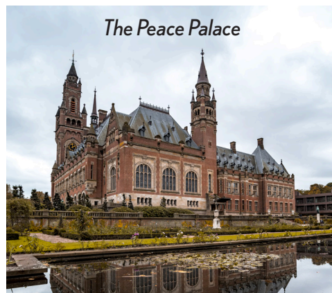
The Peace Palace