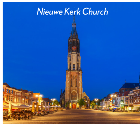
Nieuwe Kerk Church