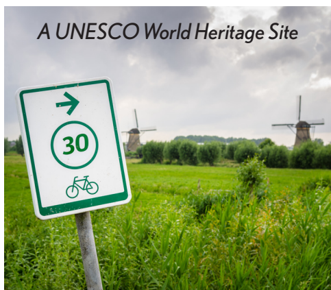
A UNESCO World Heritage Site