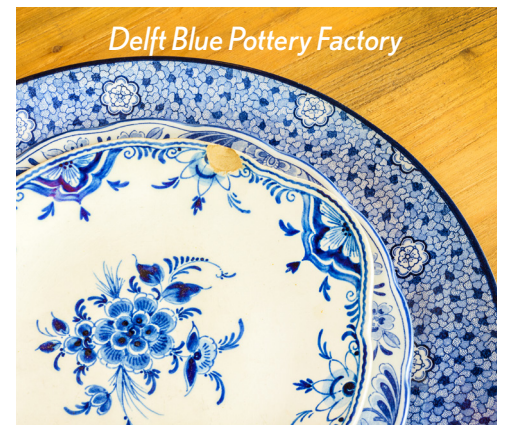
Delft Blue Pottery Factory

You will continue to the main square where you will be amazed by the Nieuwe Kerk, the second highest church tower in the Netherlands. Opposite, you have a spectacular view of City Hall designed by Hendrik de Keyser after the original burned down in 1618.