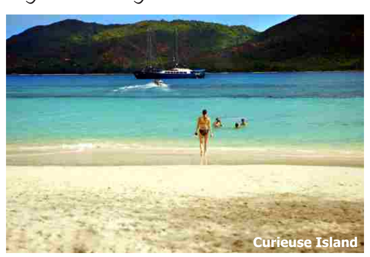
Day 6 - Thursday

Warbler). The nature trail leads to a spectacular cliff-top view the island's beautiful beach and turquoise waters. Sail to St. with the largest frigatebird roost outside of Aldabra. Aride is Pierre, the small granite outcrop just off Praslin for more