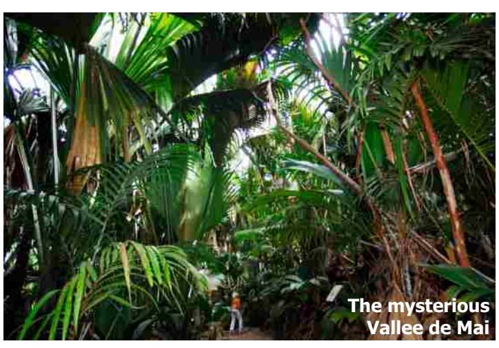
Day 2 - Sunday

the Captain's welcome briefing. Depart Port Victoria at disembarkation to the famous World Heritage Site, the Vallee community where ox-carts and bicycles still remain the most 1200hrs, sailing from Mahé to a late afternoon anchorage at de Mai Nature Reserve. This ancient forest is home to the common mode of transportation throughout the island. La Round Island, just off the isle of Praslin. In the evening, curiously shaped double coconut, the coco de mer, as well as Dique is home to the endemic Seychelles Paradise Flycatcher, introduce yourself to Creole cuisine with a welcome barbecue the Black Parrot, unique to Praslin. Explore the valley's eerie and is perhaps most famous for its massive granite boulder or enjoy other water sports.