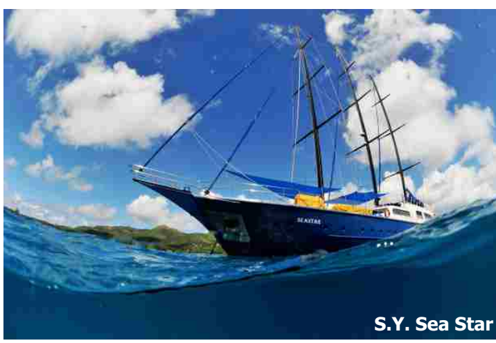
Day 5 - Wednesday

Soeur (the Sisters) for excellent snorkelling and diving, and for After lunch, sail to Aride Island, a globally important nature uninhabited island. Experience the island's vast mangrove a relaxing visit of these unique and completely uninhabited reserve with more native bird species than any other island, forests and its giant tortoise farm, along with the historic ruins tropical islands. In the afternoon, visit Coco Island, one of including five endemics and the world's largest population of 3 of this former leper colony. After a barbecue lunch on the Seychelles' tiny granite jewels, a fantastic spot for snorkelling species (Lesser Noddy, Audubon's Shearwater and Seychelles island, enjoy an array of water sports or simply relax and enjoy the only natural location in the world for Wright's Gardenia and water-sports. 400 species of fish have been recorded around the island.