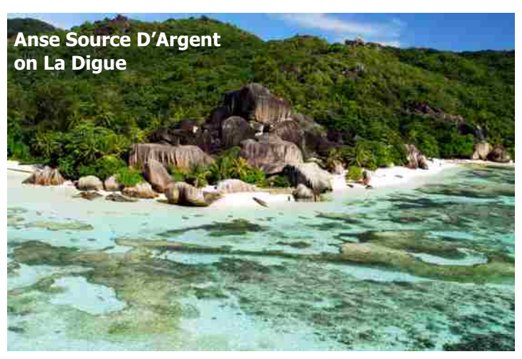
Day 3 - Monday

Embarkation at the Inter-Island Quay at 1030hrs, followed by Sail to Praslin, Seychelles' second-largest inhabited island, for A morning sail brings the vessel to La Digue, a sleepy island pathways beneath its canopy of massive palms, before formations at Anse Source d'Argent, which is thought to be the returning onboard for afternoon opportunities to dive, snorkel most photographed beach on earth. Explore the entire island by bicycle, perhaps stopping by Union Estate, a sprawling network of traditional island activities, including a copra mill, vanilla plantation, and shipyard.